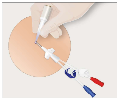
SecurePortIV™ adhesive can be used on central lines by placing it over the insertion site and/or anywhere along the exposed portion of the catheter. 6